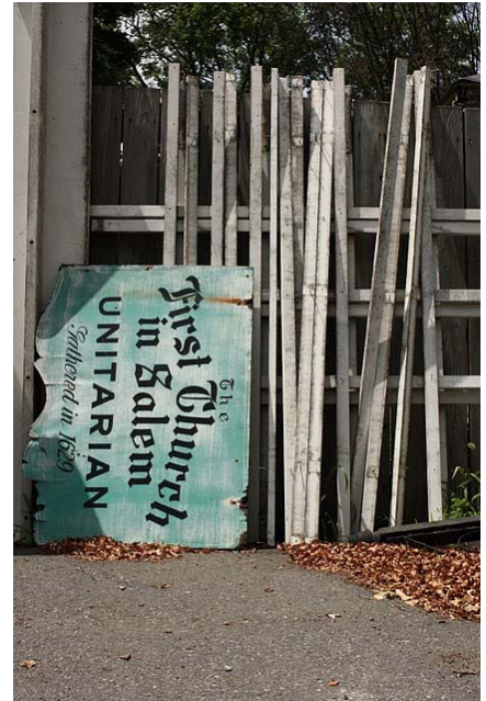
Images of clean up and preparation for renovation.