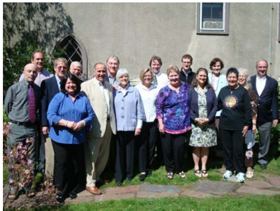
First Church Choir.