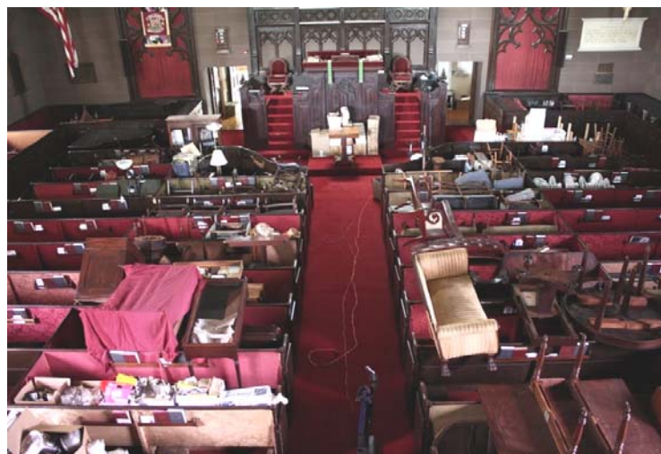
Items being stored in the Meetinghouse during renovation.