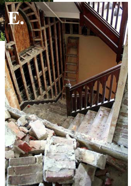
A. Interior window into old admin office. B. Old admin office. C. Garden as seen from tower. D. Rev. Barz-Snell's door...through the restroom. E. Stairs to basement.